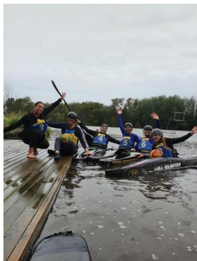
Ladies training on IWD