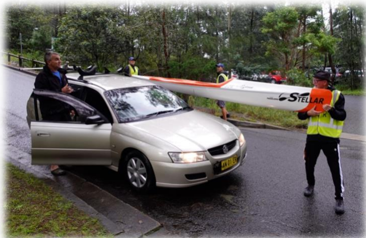
Lane Cove members off-loading a visitor's boat.

On arrival, the weather was fine and the Lane Cove members provided their usual incredible service – they off loaded our boats and placed them on the grass in Divisions while we went off to park and get our gear organised.