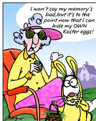
The b.g.c.c. grey army