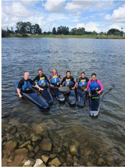
The Mighty Burley Babesa