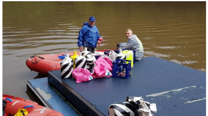
Dismantling the course.