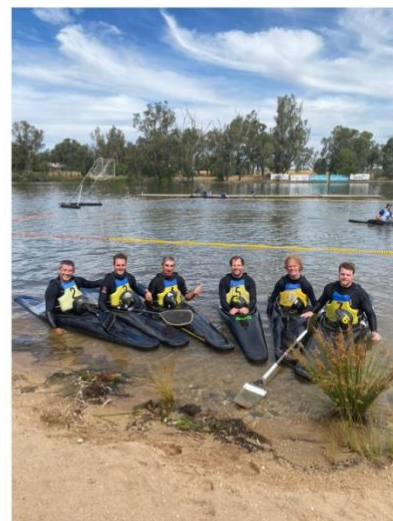
Kanusport at Nagambie