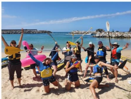
Ladies Coast Weekend