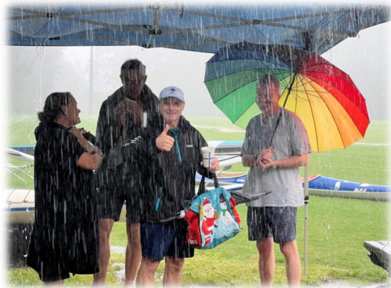
It bucketed down and everyone copped it!